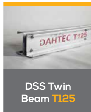
DSS Twin Beam T125

Secondary Runner. Is a galvanized high strength steel beam designed a structural member to support plywood in deck forming applications.