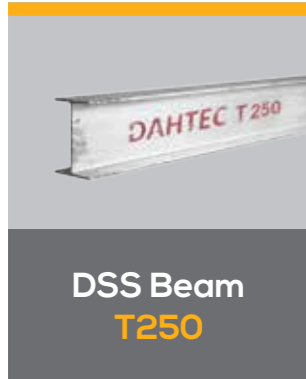
DSS Beam T250

Main Bearer. The all steel beam give you maximum strength and durability.