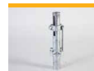
Adjustable Starter Member