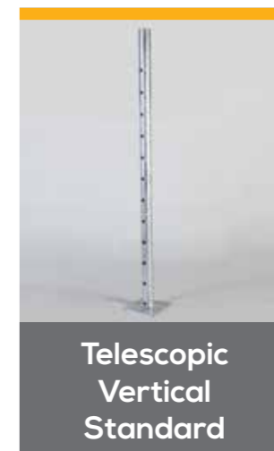
Telescopic Vertical Standard

It enables the tableform to be adjusted every 120mm up to 1 meter.