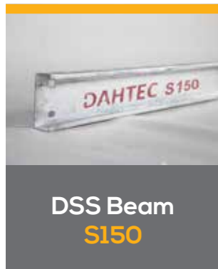
DSS Beam S150

Secondary Runner. Is a galvanized high strength steel beam used as a secondary slab support member.