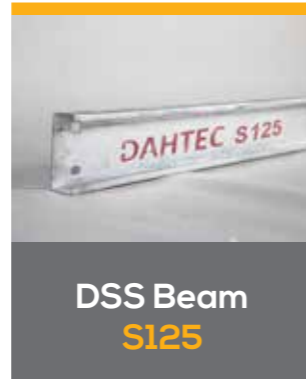
DSS Beam S125

Secondary Runner. Is a galvanized high strength steel beam. Widely used as a secondary slab support member. It can be used with plywood, requiring only nail or screw connection.