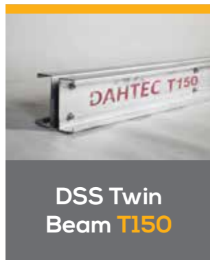
DSS Twin Beam T150

Main Bearer. Is a galvanized high strength steel beam give you maximum strength and durability.